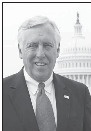
Congressman Steny Hoyer

roads and trails will remain open on Thursdays. Visitors may still explore the refuge every day of the week. Portable toilets will be available outside of the visitor center on Thursdays when the visitor center is closed.