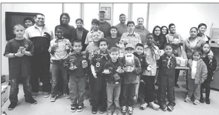
Canned goods collected by the Scouts with the help of their parents.