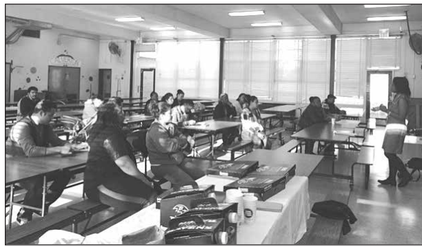
Parents from Calverton Elementary meet with the principal over coffee.