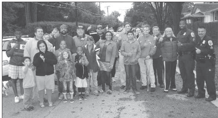
Members of the Beltsville Community and PG county police tour the neighborhood.

We are starting our Beltsville Neighborhood Watch program again. On Wed. Oct. 22, we had the First Beltsville Heights Community Neighborhood March with PG County Police Officers from Beltsville Station, attending and escorting us through our