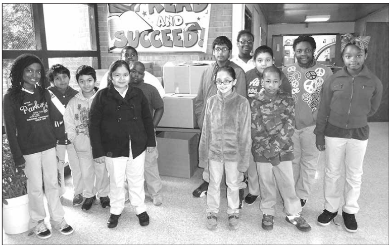
Calverton Elementary Students participate in the annual Kids Helping Kids Food Drive.