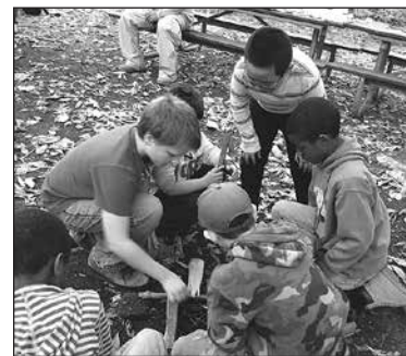
Bears and Webelos work on building a lean-to campfire.

Are you interested in discovering the fun of Cub Scouts with your son? If you would like more information, contact Regina Halper through www.BeAScout.org — just put in the zip code 20705 and look for Cub Pack 1031.