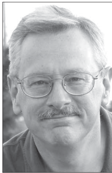
Senator Jim Rosapepe

To find out if you have already filed the one-time application in the past five years, go the Department's website at www.dat.state.md.us and click on "Real Property Data Search". Click on the County name where your property is located and enter the street address. A page on your property will be displayed; look across the bottom of the page to see if you've submitted the Homestead application.