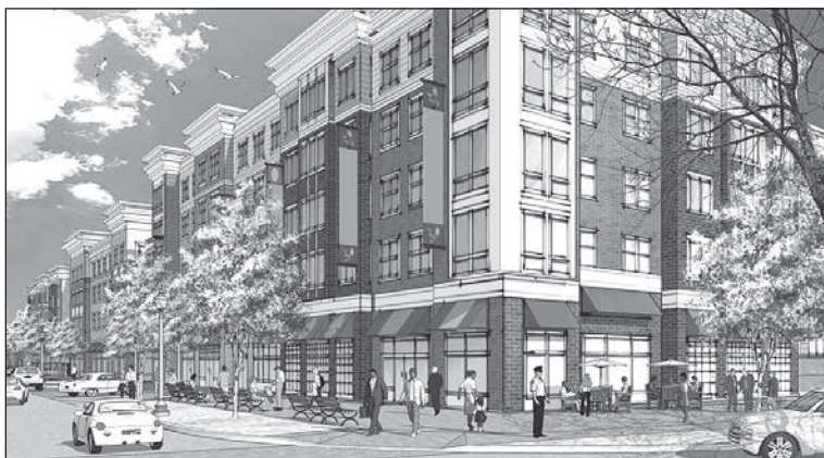
Artist's concept of the development at the Brickyard

The early concepts for the Brick Yard envisioned a first class business park of over a million square feet of space. Change was already underway in this part of Beltsville – residential neighborhoods had been established around the western side of the