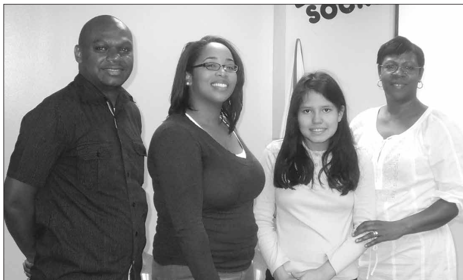
Staff members showing the new sensory room

The High Road Upper School in Beltsville has always been committed to provide comprehensive services to students with behavioral, emotional and social challenges. With a focus on providing an environment most conducive to their learning and growth, High Road School is continuously improving their programs. With