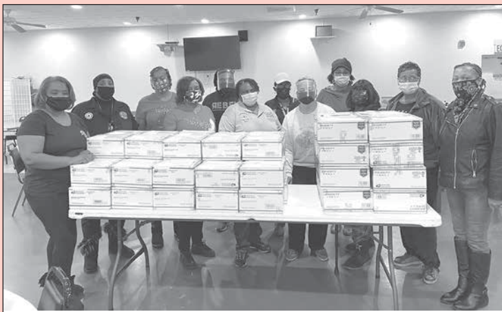
Pictured above are several dedicated American Legion Auxiliary volunteers packing Christmas care packages to send to our soldiers in Kuwait.

We hope your holidays were enjoyable although I'm sure they were a little strange this year due to the social distancing. I, for one, miss my hugs, my friends, and my family. Please, Lord, let us find a vaccine, if not a cure, for COVID 19, soon. It is especially hard for the elderly and those who live alone who have