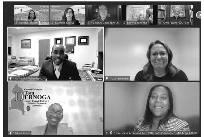
District 1 Virtual Community Conversation about the UM Laurel Medical Center on February 1, 2023

The Department of the Environment (DoE) recently hosted a virtual workshop for County residents to learn more about composting. Discussion topics included: how using your green cart helps reduce waste, how to prepare your green cart for col-