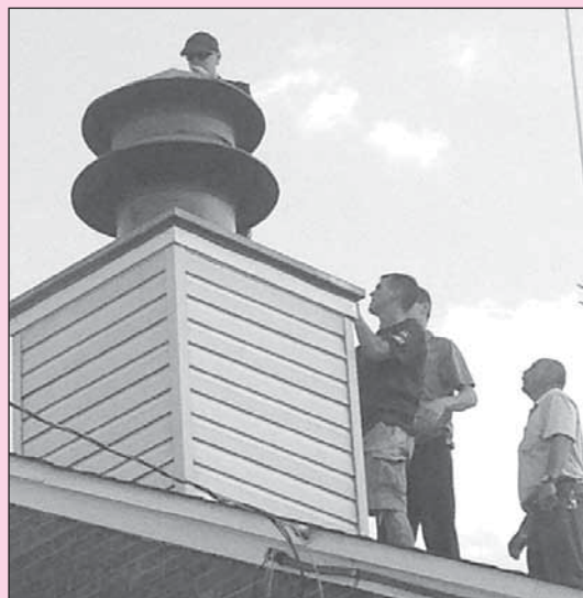
BVFD members repair the siren tower damaged in the June 29 storm

June 29 started out as a normal day at the Beltsville Volunteer Fire Department (BVFD); however, in the late evening Maryland experienced one of the worst storms it's ever seen. Along with the normal weekend volume of emergencies called into the 911 center, the strong winds and rain caused a variety of issues for the citizens of Prince George's County and an influx of emergencies for our first responders. During that Friday and following Saturday, the career and volunteer personnel from station 31 responded, working tirelessly, to 44 emergency incidents. Among the incidents that members of the BVFD responded to were transformers on fire at NASA, a building collapse in Riverdale, Md., a building fire with rescues, wires and trees down in the area from the force of the storm, alarm bells activated