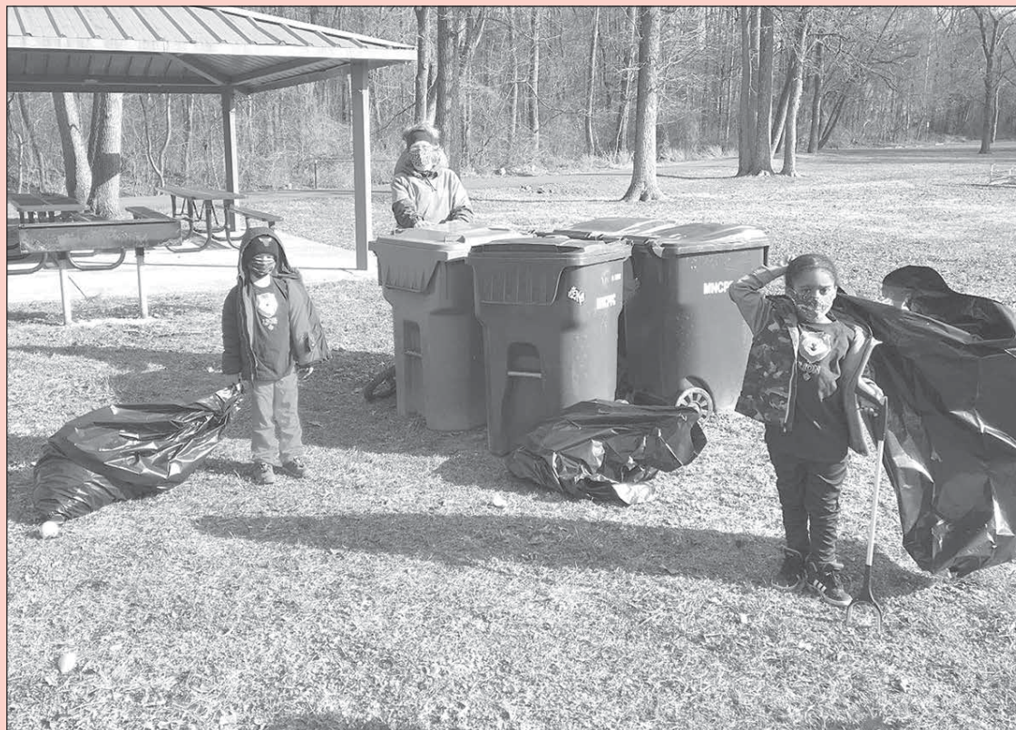
Lion Scouts with the trash they collected

For the coming year, our families will be working on achievements on Zoom with our den along with monthly meetings in the outdoors, and we keep it fun! We are out in the parks and on the trail when we can, wearing our masks, cleaning our hands, and staying 6 feet apart.